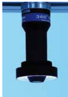
LTRNPWHI used in combination with an Hole Inspection Lens .