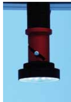
LTRNPWHI mounted on a MC3-03X macro lens.