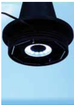
LTRNPWHI assembled into a PolyView Lens to provide inner sample illumination.

This illuminator can also be used in combination with OE MC3-03X Variable Macro Lens over the entire range of magnifications.