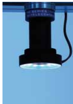
LTRNPWHI fits OE small telecentric lens for perfect sample illumination and accurate measurement.